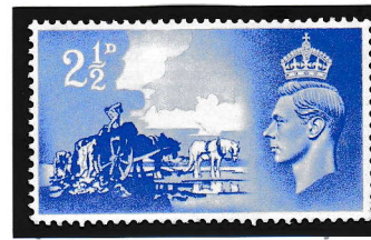
2½d 'Islanders Gathering Vraic'