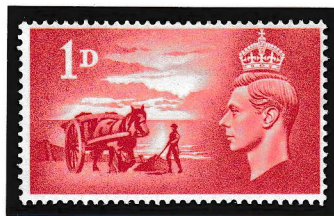
1d 'Gathering Vraic'

The stamps are sometimes known as the "Seaweed" issue and were issued on the 10 th May 1948.