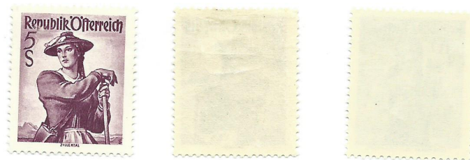
100 mesh screen, grey paper, horizontal / vertical rippled yellow gum