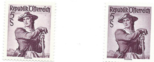
100 mesh screen, white fluorescent paper, white gum 70 mesh screen white fluorescent paper, white gum