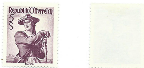
100 mesh screen, white paper and smooth white gum