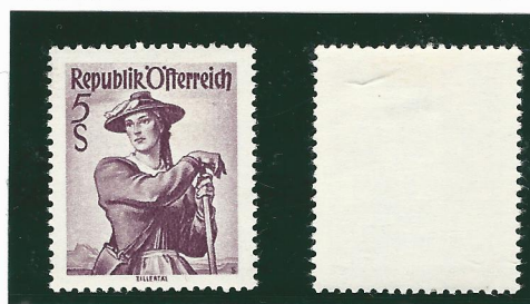
100 mesh screen, white paper and smooth white gum