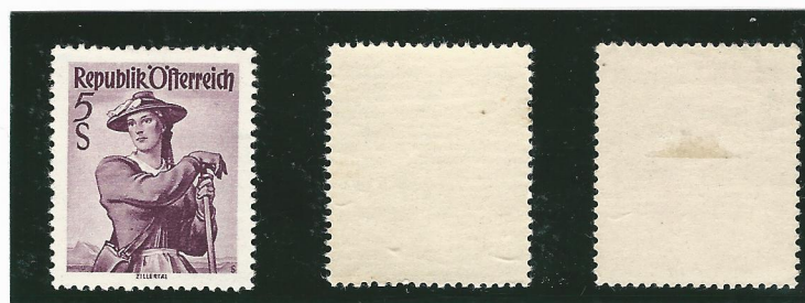
70 mesh printing screen, grey paper, smooth / horizontal rippled yellow gum

The 3g is only printed in 70 mesh. The 100 mesh screen appears smudged.