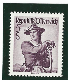
100 mesh screen, white fluorescent paper, white gum