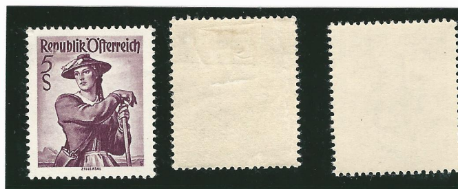
100 mesh screen, grey paper, horizontal / vertical rippled yellow gum