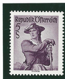
70 mesh screen