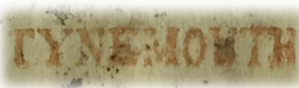
Figure 4 (above). TYNEMOUTH (red) one straight line uppercase script mark, located on the cover's front.