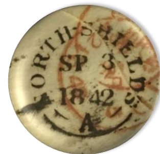
Figures 2 (left) and 3 (above). Obverse: Featuring backstamp (Circular dated double arc). From: NORTH SHIELDS SP 3 1842.