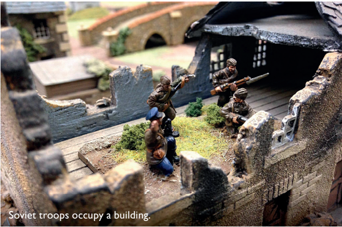
Design Notes – Specific None.

There is nothing here which prevents a relocation of this scenario to almost anywhere at any time. It is a straightforward attack/defend scenario, with two very well equipped, motivated and competent opponents. Its interest lies in the specific location and the matching of the best units and equipment of two well honed armies at what might be described as the exact tipping point in the progression of a campaign. So, pick any campaign from history which you like and have figures for, work out where the exact balance of abilities is and pitch the best each side has to offer against each other over whatever might be typical ground for a battle. That’s a recreation of this scenario.