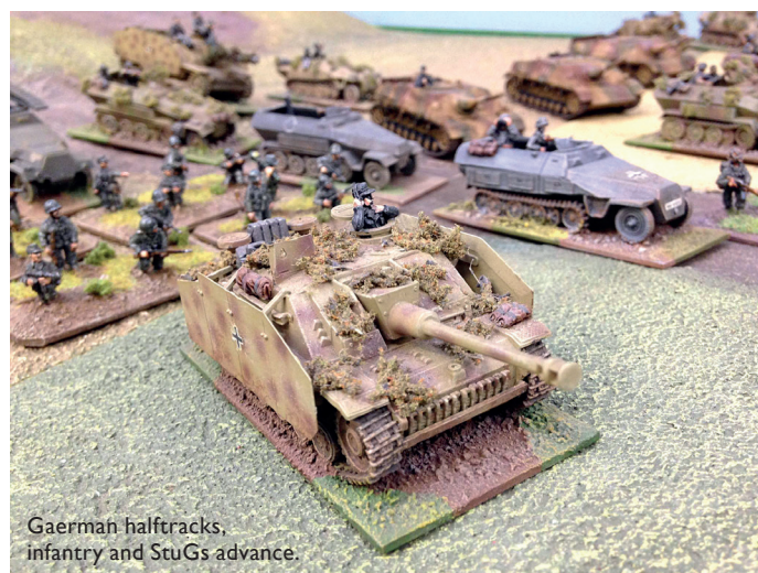
German halftracks, infantry and StuGs advance.

The game lasts 14-16 turns. At the end of turn 14, roll 1D8+1D4. On a roll of 9+ the game finishes immediately. If it continues, roll again at the end of turn 15 and end the game on a roll of 7+. Otherwise the game finishes on turn 16.